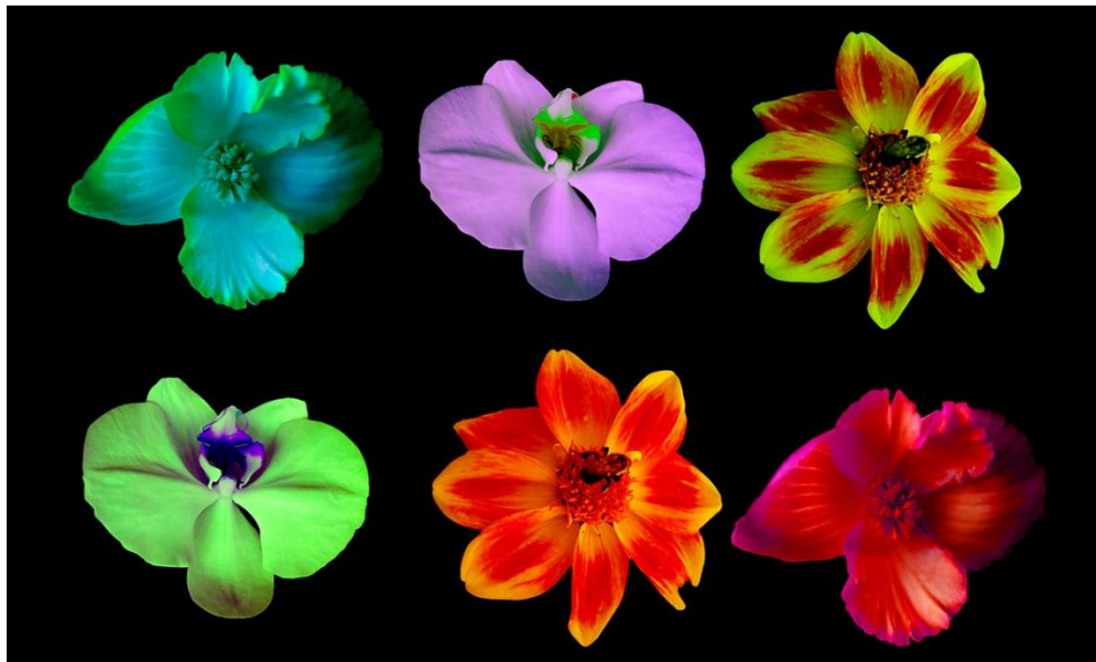
Figure 1. Bloom-Simulated growth patterns through bio-acoustic stimulation

Exploration and Visualization of Bio-acoustic Communication in Plants